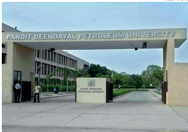
The placement season at PDPU is underway

Explaining the success formula, he said, "Efforts are made to train MBA students to meet changing requirements of businesses. The school has also been making efforts to widen the placement market. Visits by industry experts, industry contact programmes and futu-